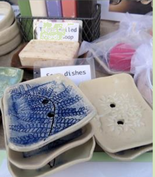
What is French Triple