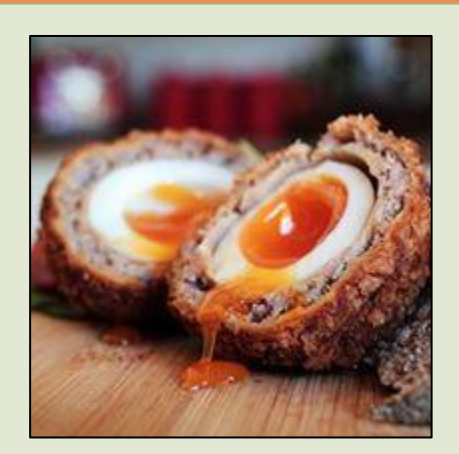
Clucking Pig Gourmet Scotch Eggs www.thecluckingpig.com