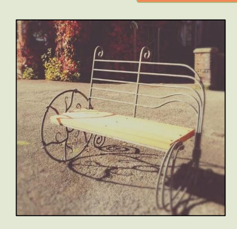
Environmental Art – Blacksmith www.environmental-art.co.uk