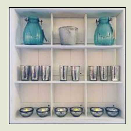
Rumah Home Lamps, throws, soaps and scented candles www.rumahhome.co.uk