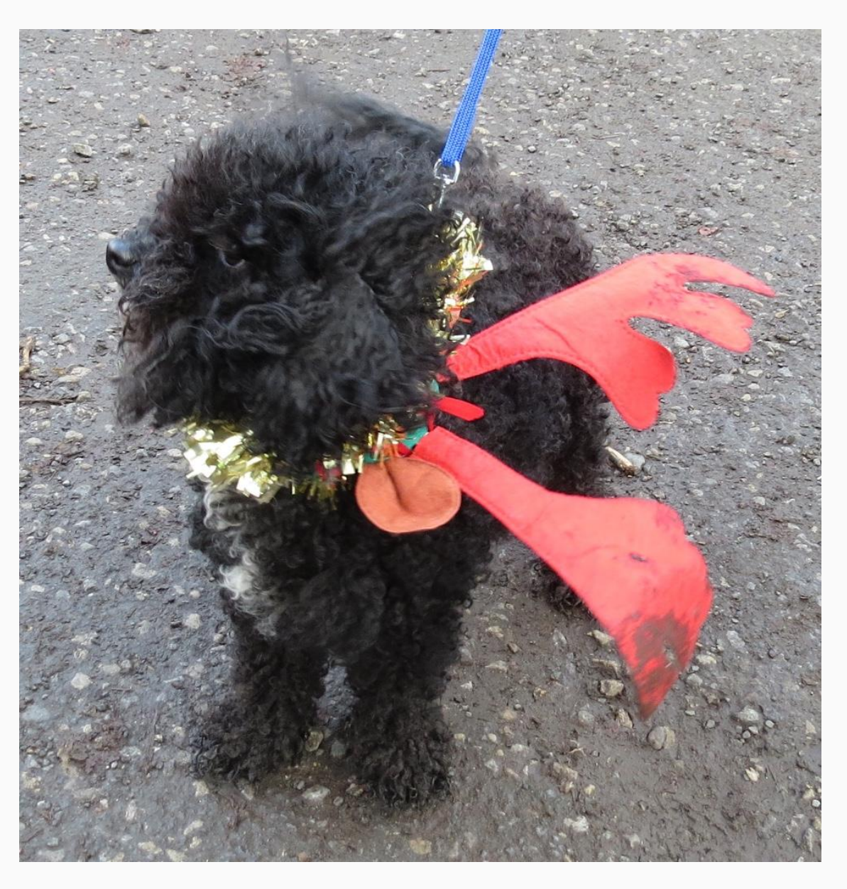
Copyright © 2016 Hovingham Village Market, All rights reserved. You are receiving this email as you've previously expressed interest in The Hovingham Village Market.