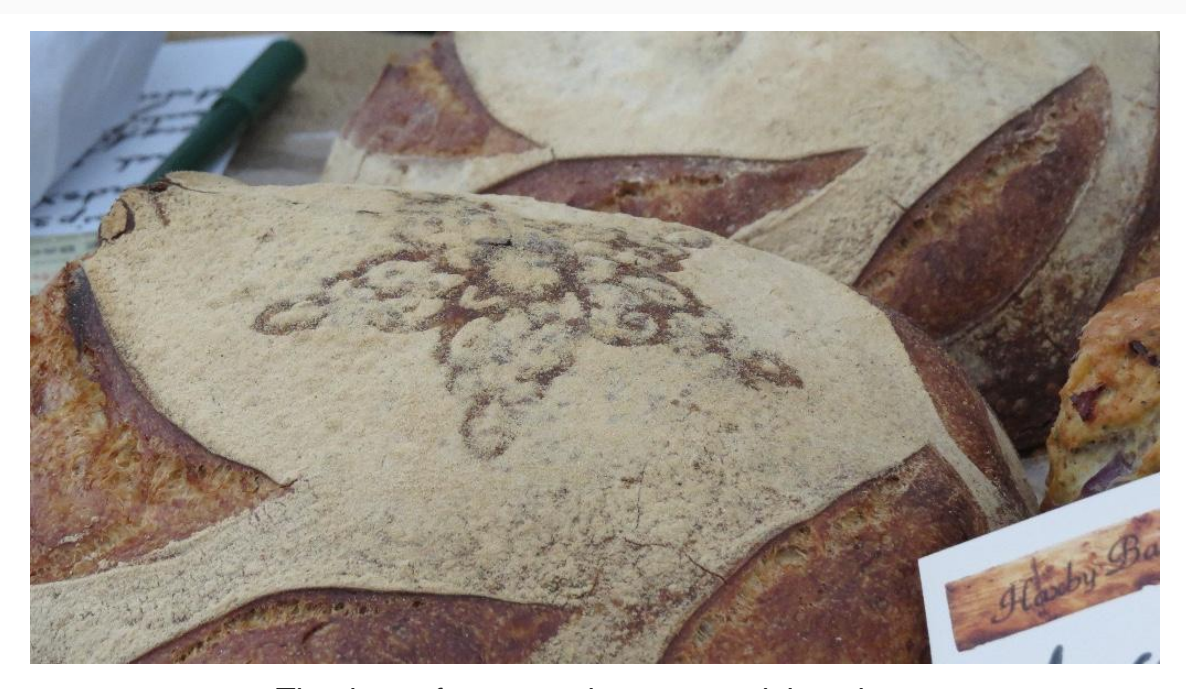
Thank you for supporting our special market. We wish you and your families a very Happy Christmas from the Hovingham Village Market

Next Market dates: Sat 17th Dec Sat 4th Feb